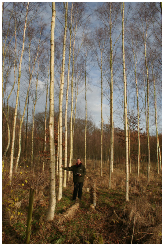
Figure 1: Hybrid Birch clone Granat, age: 20 years

At the age of 30 years the best 20 individuals were selected, established in vitro cultures at the Lower Saxon Forestry Research Institute (Niedersächsische Forstliche Versuchsanstalt) tissue culture laboratory and reproduced. In spring 1989 clone testings were established at the Lower Saxon Forestry Field Offices Neuhaus and Elm. Another area was generated in autumn 1990 at the Forestry Field Office Dannenberg.