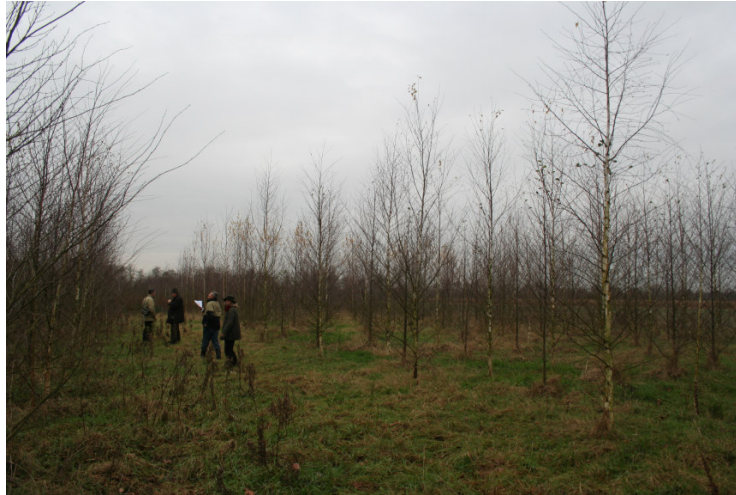
Figure 3: Afforestation of Betula spp. on humus-rich soils, Age: 5 years

Provided that a good water supply is guaranteed, even on meagre sandy sites birch exhibits high performance ability. But the same applies here: Best yields will be realised on humus-rich soils.